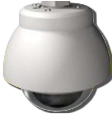
DOH-1100 Outdoor Housing