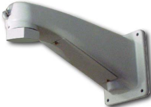
WMB-1100 Wall Mount

The Indoor/Outdoor dome housing is used with a PTZ dome camera. The housing is constructed of aluminum, steel, and plastic. It is designed for mounting on walls or ceilings. The housing meets international IP65 standards for dust and moisture resistance.