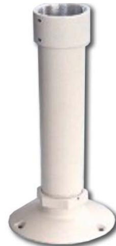
CMB-1100 Ceiling Pendant Mount

Wall or Ceiling mount to be specified with order